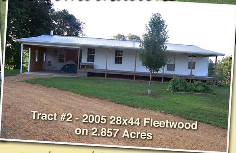
Tract #2 - 2005 28x44 Fleetwood on 2.857 Acres

Beautiful, quiet setting located in Hickman County. Acreage is fenced for cattle/horses. Good building sites!