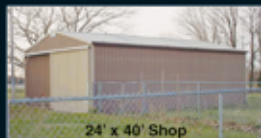
24' x 40' Shop

TRACT 11 - 1.00 Acre - Swing Tract - can only be combined with adjoining tracts.