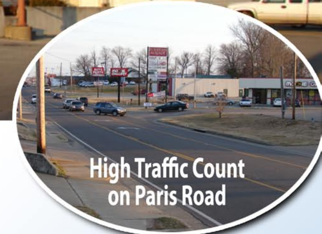
High Traffic Count on Paris Road

Location: 1012 & 1014 Paris Road Mayfield, KY. Next To Taco Johns. A SELDOM OPPORTUNITY TO PURCHASE PRIME COMMERCIAL PROPERTY!