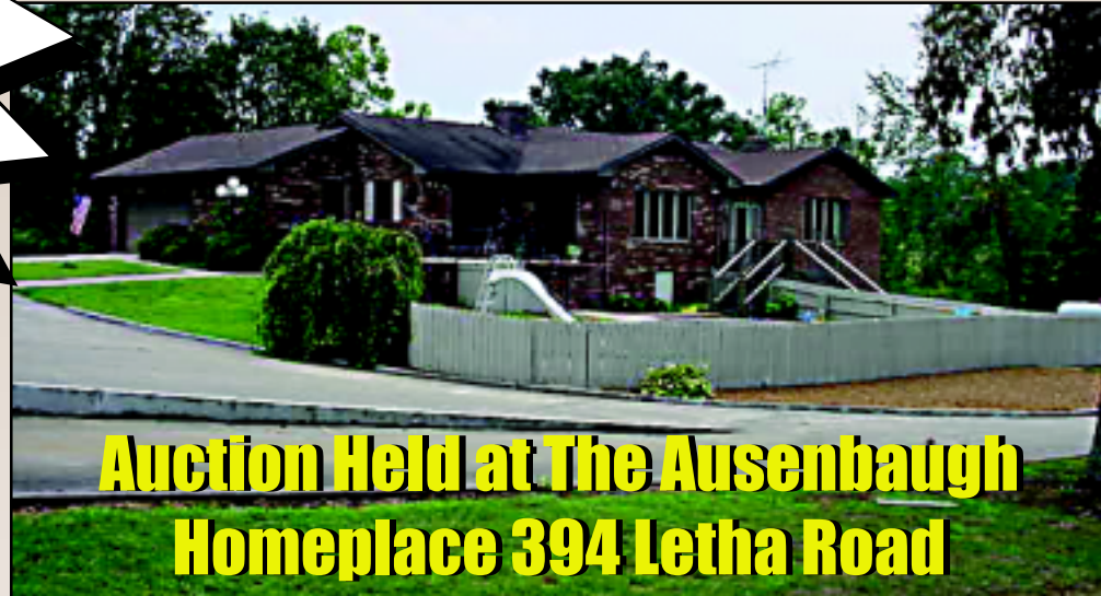
Auction Held at The Aussenbaugh Homeplace 394 Letha Road

Home and Farms #1 & #2 Location: 394 Letha Road, Wadesboro Road, and County Line Road MAYFIELD, KY. From Mayfield, KY Take Hwy. 58/80/402 East 8.2 Miles To County Line Rd., Go North 8/10 Mile On County Line Road To Letha Road Farms # 1& 2. From Benton Take Hwy. 58 Southwest 8 Miles To Hwy. 58/80/402, Proceed West 2.3 Miles To County Line Road.