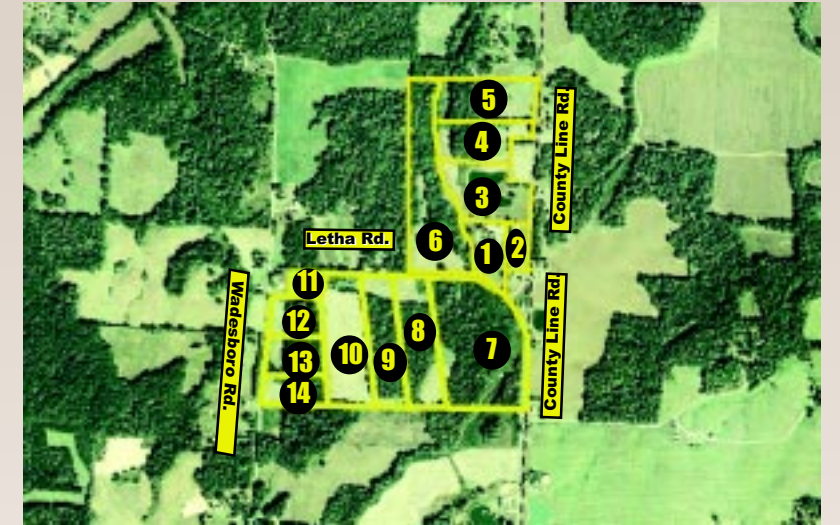
Real Estate Sells First At 10:00 AM. Auction Held At The Aussenbaugh Homeplace 394 Letha Rd.

*Graves County Farm Service Agency Farm #11510 Tract #4962 Corner Of Wadesboro Road and Letha Road Having 25 Acres In CRP Program With Annual Income Of $2,096.00. Contract Until 2007.